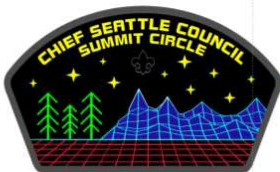
Summit Circle Members