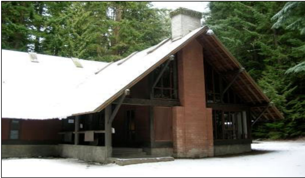
Lodge (capacity: 70)