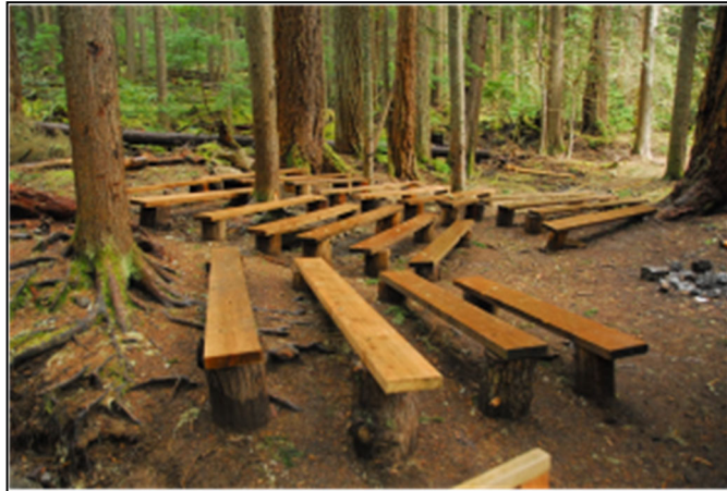
Campfire Bowl Seating