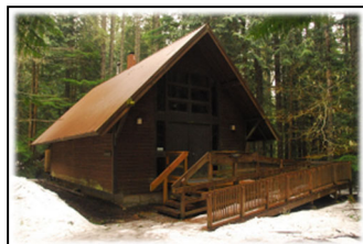
Slide Mt. – ADA ramp