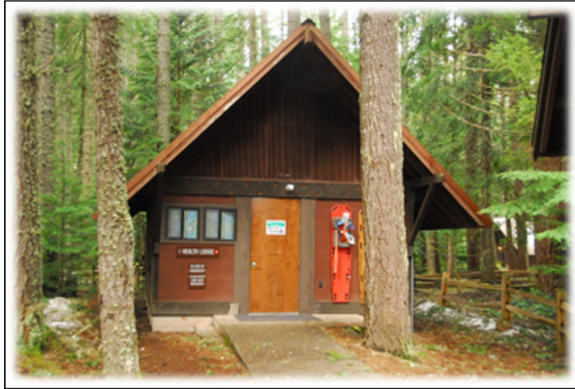
Women's Restroom/Health Lodge

Health Lodge used for medical emergencies; it also has an ADA shower/toilet, electric heat, sink, and a bed for sleeping. The Women's Restroom on the other side has four stalls, sinks, and three showers.