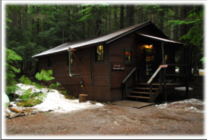
Craft Lodge/Trading Post Trading Post is run out of the back. Building has propane heater, no water.